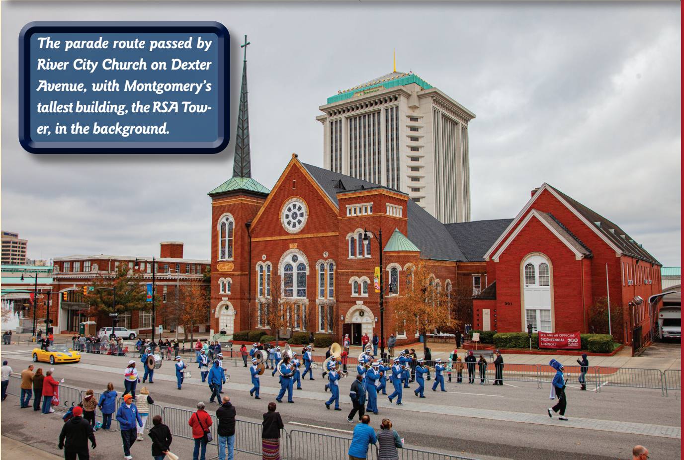
The parade route passed by River City Church on Dexter Avenue, with Montgomery's tallest building, the RSA Tower, in the background.