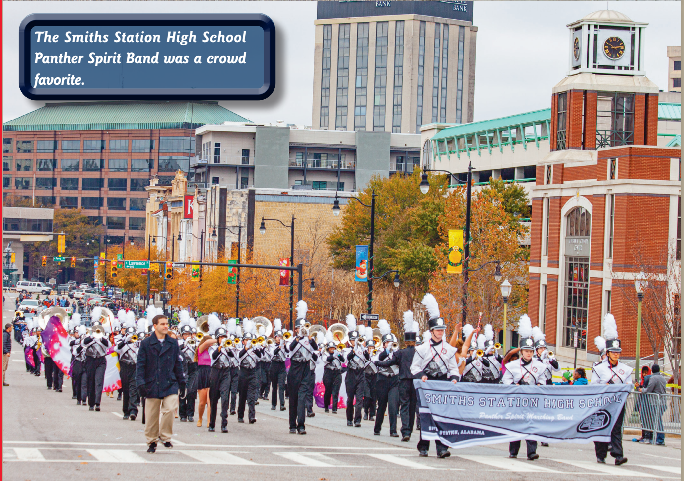
The Smiths Station High School Panther Spirit Band was a crowd favorite.