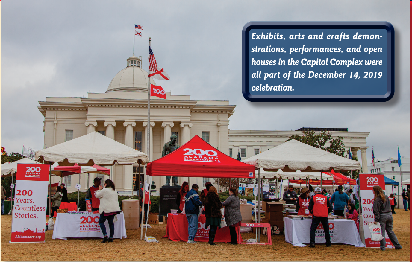
Exhibits, arts and crafts demonstrations, performances, and open houses in the Capitol Complex were all part of the December 14, 2019 celebration.