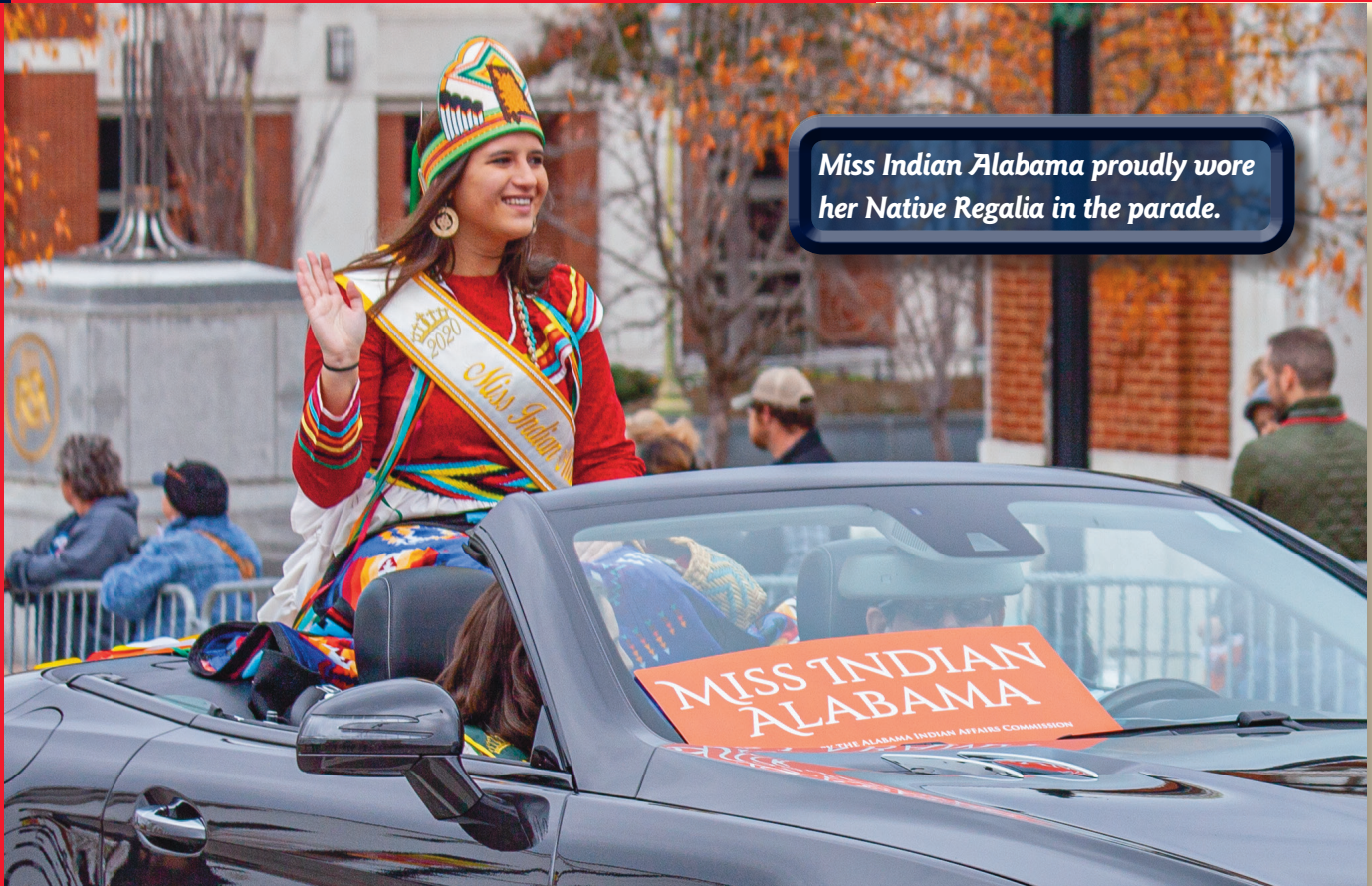
Miss Indian Alabama proudly wore her Native Regalia in the parade.