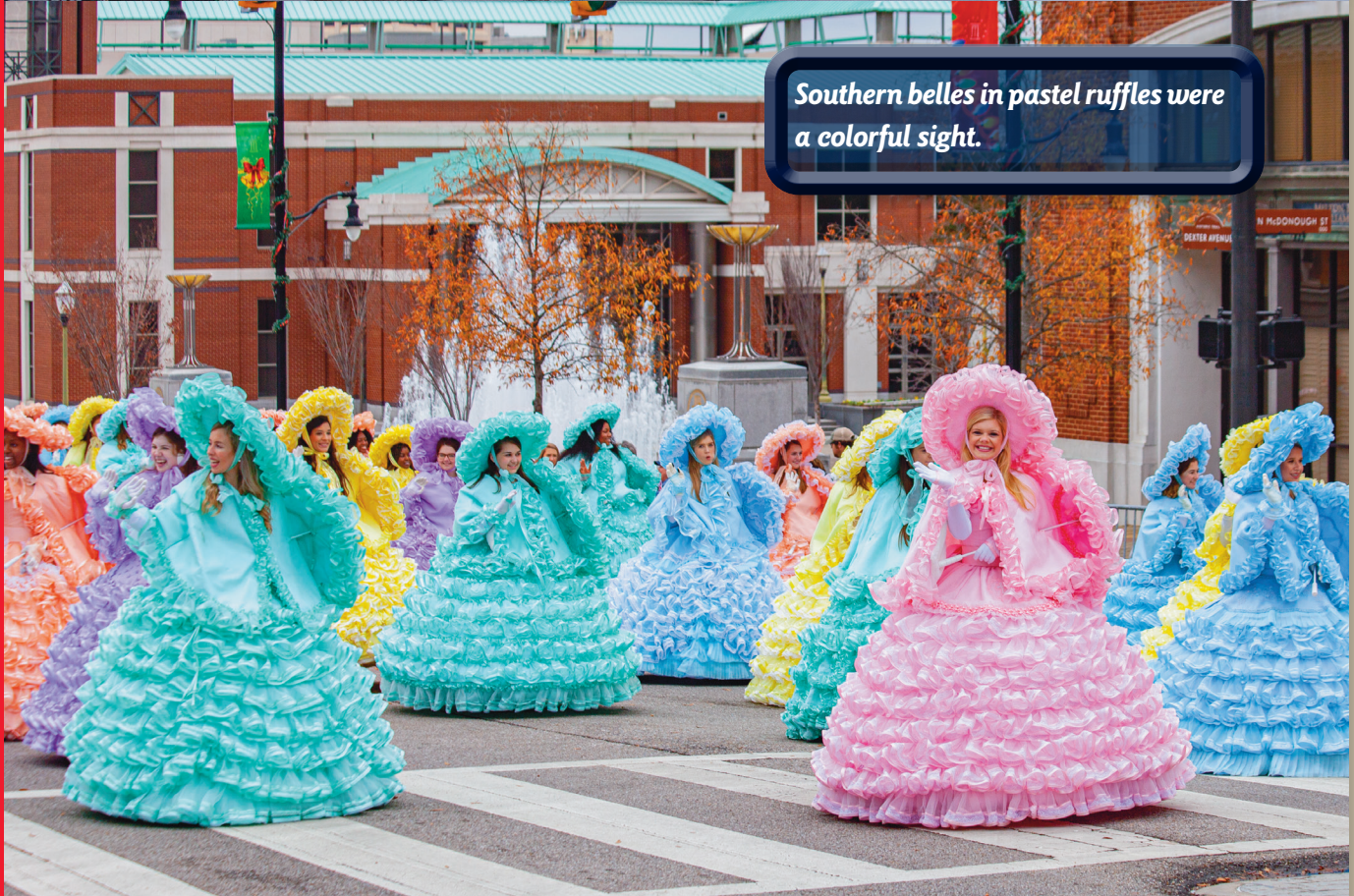
Southern belles in pastel ruffles were a colorful sight.